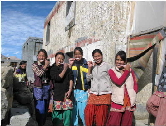
Making good use of clean water