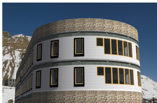
A CAD rendering of the future school in Kaza

the large number of poorer families in outlying villages who need greater financial support and hostel places. Thanks to your subsidies, a people who might otherwise remain trapped at a backward stage of development with their culture under threat are getting an appropriate education for some children at least. It is time to expand that number. Please give generously and help bring this school into being!