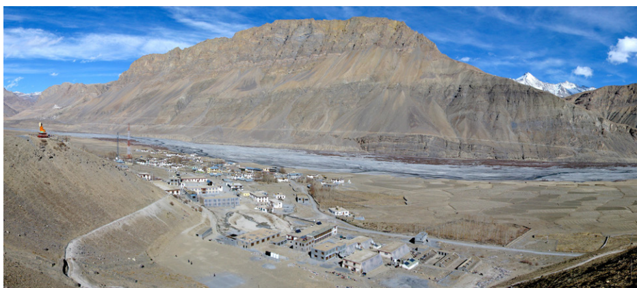
A view of Munsel-ling School, Rangrik Village, Upper Spiti Valley, and in the background (on right) is snowy white Shilla Peak, one of the tallest mountains in Himachal Pradesh at over 6000m

Further thanks to the Trans-Himalayan Aid Society (TRAS) of Canada. As part of their focus on girls education they are offering a total of six scholarships for Spiti girls to attend college anywhere in India. Two will be