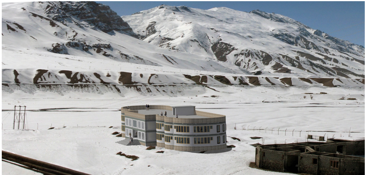
Building a new school in Kaza... A vision of the school we hope to have soon