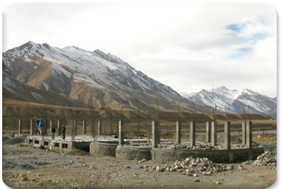
Construction has begun and the foundation has been laid

Kaza Primary School is a very successful part of the Rinchen Zangpo Society for Spiti Development's Education Programme. Our first branch school in Spiti, it is very popular with the parents of Kaza, the Spiti headquarters, and in expanding to meet the demand for places for their children, we have now, after six years of progress, completely outgrown our present rented building. 78 boys and 88 girls are studying there this year with the help of 14 staff. We have begun laying the foundations of a completely new school building on a very pleasant and spacious riverside site.