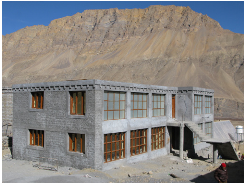
Julie Clemence Memorial Junior Girls Hostel

The warmth percolates through to the more insulated dormitory where it is retained in the evening when doors are closed, a low cost remedy for winter's freezing