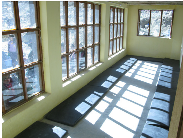
Hey, Sunshine...! A heating source in great abundance in sunny Spiti Valley, now bringing light and warmth to the hostel's study room

temperatures at 3,600 metres altitude. The hostel is now complete with all fittings. The money for it was all raised by Aid for Himalayan Education of the UK, in memory of the late Julie Clemence, a very capable supporter of this and other educational projects.