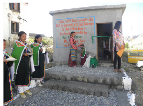
The high-tech chlorination station now on-site at Munsel-ling

surface water supply, a UBC graduate engineering student team piloted batch chlorination of water and drinking cum hand washing stations on the school campus in 2012. This year treated water capacity was increased so that the number of water stations, of improved and more durable construction, could be expanded to four to provide easy access from all parts of the campus. Medical students meanwhile taught the importance of hygiene and personal cleanliness while providing iron supplements.