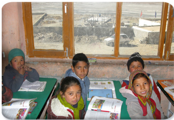
Cramped conditions in our rental facility while our new school takes shape in the background