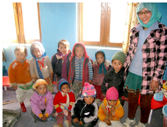
Students and teacher of our branch pre-primary school in Kibber

Branch pre-primary schools in some of the larger villages in upper Spiti have been running for a few years. Last winter we organized learning centres in several villages also. Here older students gave help to younger ones to keep them abreast of their studies through the long winter break when movement even from village to village can be very restricted due to the snow and cold and poor footwear. This gave a boost to some children's studies. Also the Rinchen Zangpo Society has now been in existence long enough so that some of our former students who went away to complete their further education are coming back to work in our schools and offices, which is very gratifying and helpful of course.